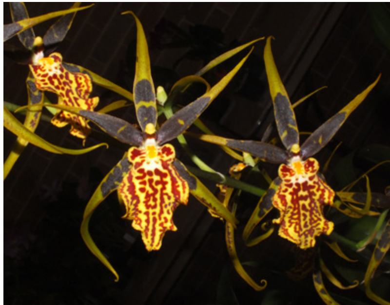
Bcd. Gilded Tower 'Mystic Maze' (F Musial & L Chang)