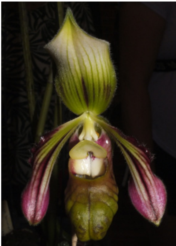
Paph. sangii