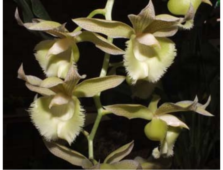
Ctsm. Cape of Island (J Gafa)