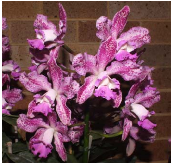
Cat. Caudebec Candy