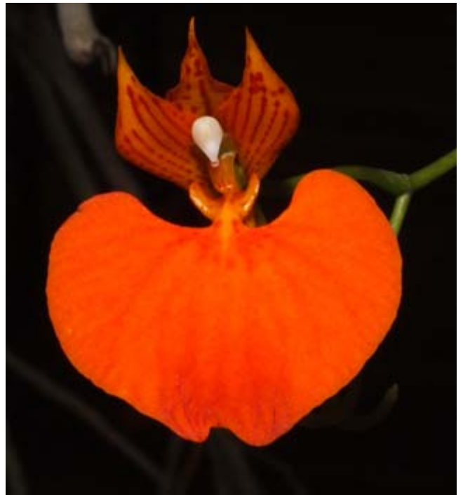
Comp. speciosa (L&G Bromley)