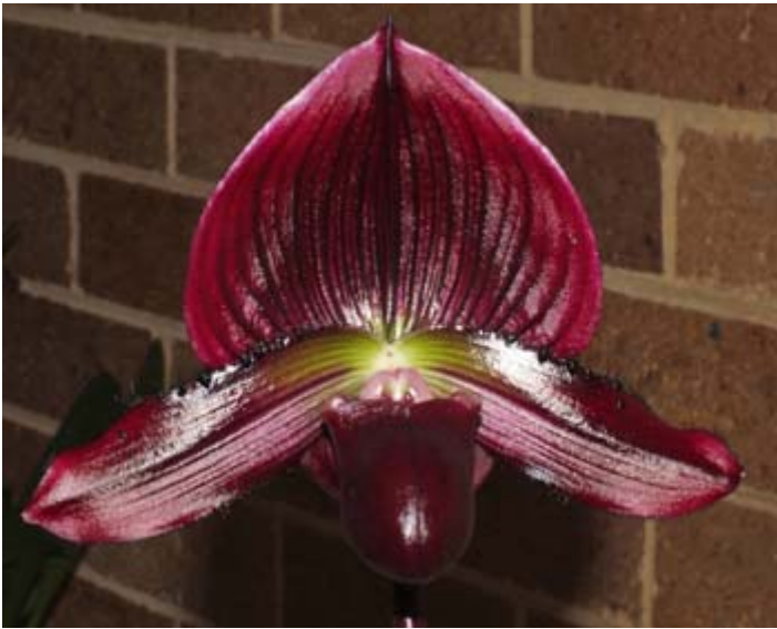
Paph. Hung Sheng 'Red Apple' x Hung Sheng 'Flame' (S Tay)