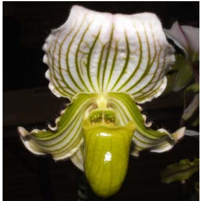
Paph. fairrieanum semi alba (V Clowes)