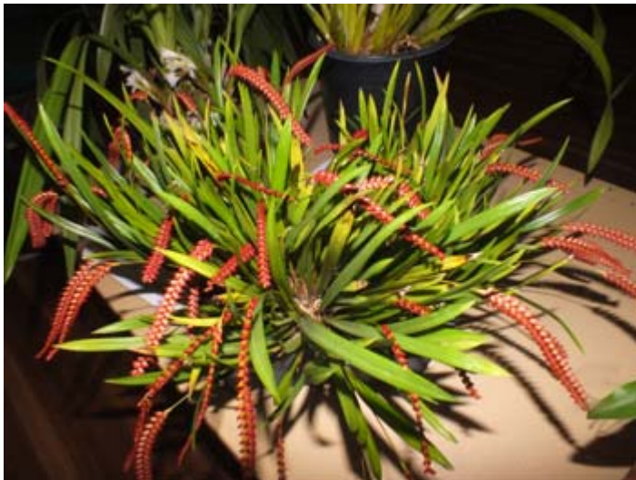
Ddc. saccolabium (V Clowes)