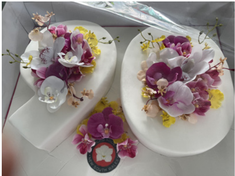
The magnificent cake!