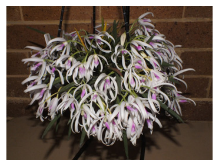
Lpt. bicolor (J Gafa)

[Ref. https://en.wikipedia.org/wiki/Pleione_(plant)]