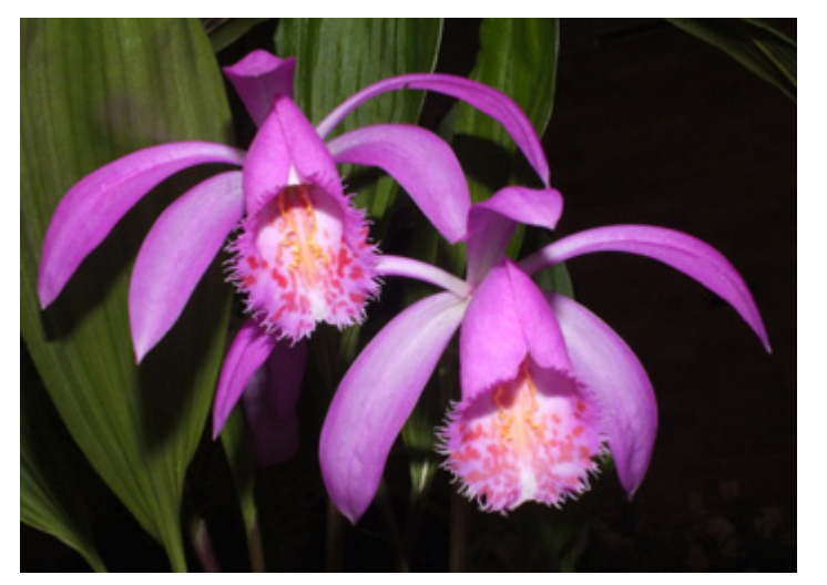
Pln. Tongariro 'Trudy' (J Robinson)

Pleione is a small genus of predominantly terrestrial but sometimes epiphytic or lithophytic, miniature orchids.<sup>[2]</sup> This genus is named after Pleione, mother of the Pleiades (in Greek mythology), and comprises about 20 species. Common names of this genus include peacock orchid , glory of the east , Himalayan crocus , Indian crocus and windowsill orchid .