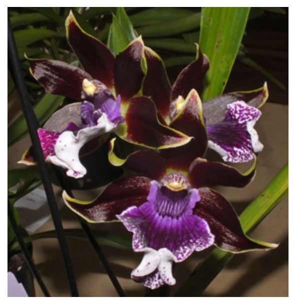
Z. Debbie De Mellow 'Honolulu Bay' (RG Blaxland)