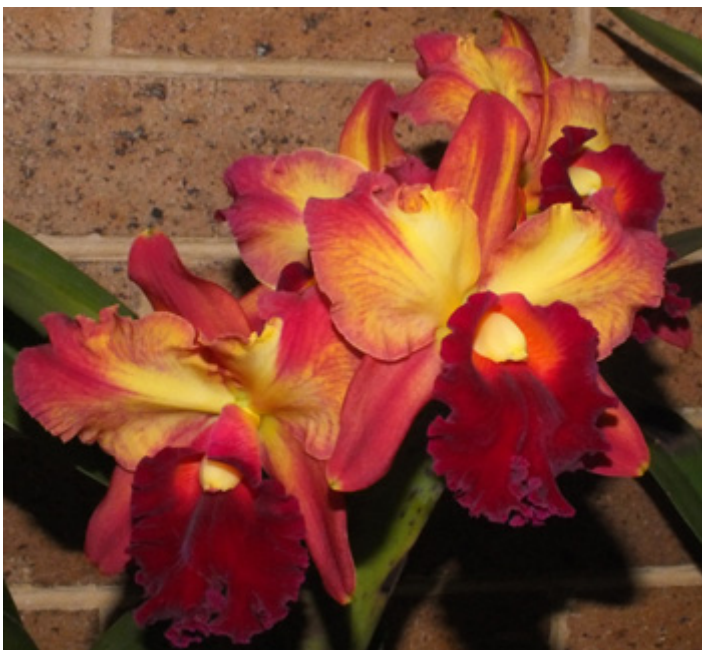
Rlc. Toshie Aoki 'Amanda Fai' (L&G Bromley)