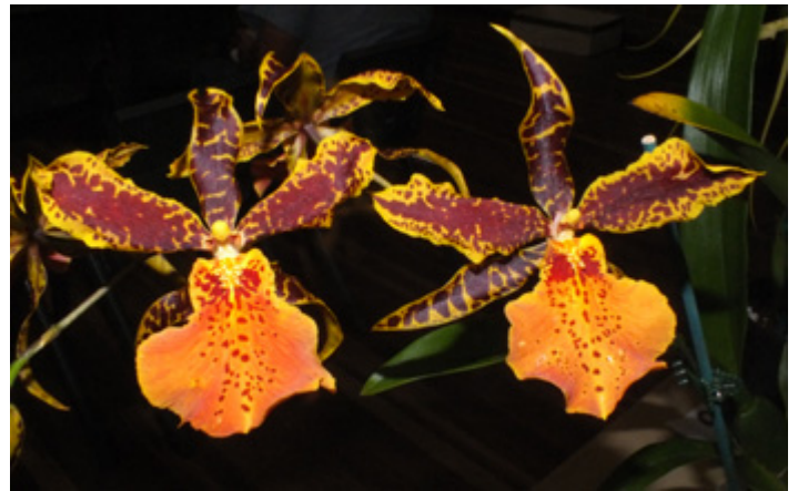
Alca. Hilo Ablaze 'Hilo Gold' (M Drury)