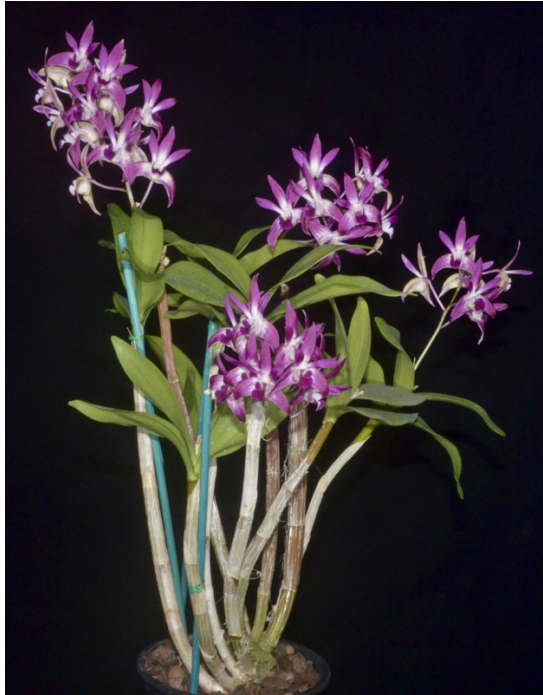
Den. 'Binha-Ba 'Violet Hours' (DUNO, AM)